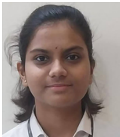
Sriya II PU Science, BTM Layout

The story of Flight 171 serves as a grim reminder of how fragile life can be – and how even a short moment in the skies can leave behind a legacy of heartbreak, reform, and resilience. For the students of B.J. Medical College and the sole survivor, life will never be the same again.