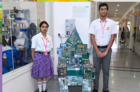
Learning Areas Showcased at FIND Festival 2024

The Learning Area Showcase featured a vibrant display from over 300 students in Grades 3 to 8 across our campuses, showcasing the diverse learning experiences cultivated within our classrooms. This event was a testament to the rich and varied educational practices we engage in every day, highlighting the integration of creative, analytical, and experiential learning in our curriculum. The Showcase brought to light the tangible outcomes of our educational approach, with students demonstrating enhanced creativity, critical thinking, and teamwork.